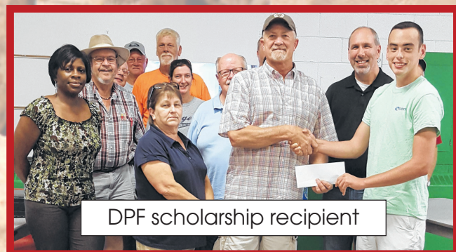
DPF scholarship recipient